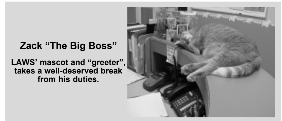
Zack "The Big Boss"

LAWS' mascot and "greeter", takes a well-deserved break from his duties.